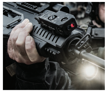
Low profile for mounting in front of scopes, holographic or NV Sights